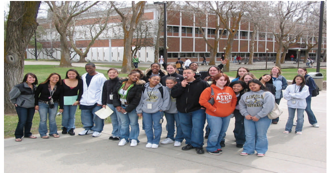
Students at Central Washington U. during college visit

Services: To accomplish our goals we offer a variety of college preparation services including college visits,